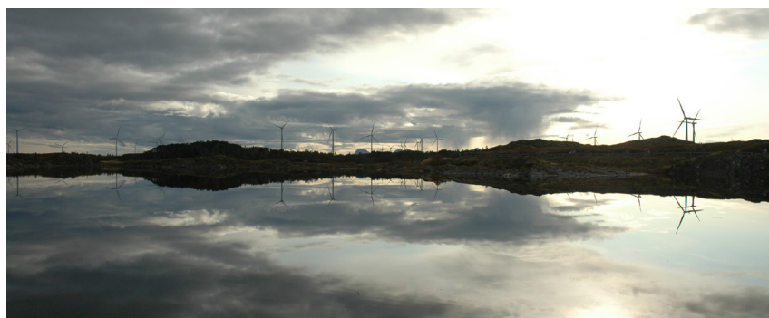
The wind farm viewed north

On average, six sea eagles are killed every year due to collisions with the wind turbines on Smøla. However, the sea eagle population is healthy and has grown since construction of the wind farm. In 2009, we registered activity in 61 sea eagle territories on the island – the largest on record. At the time, the sea eagle population was estimated to about 150 animals, and as many as 10 000 nationwide. The birds nest to a very little extent inside the actual wind farm, while the activity on the rest of the island remains fairly high. Statkraft has contributed with significant research funds to map sea eagle collisions and attempts to limit the problem. The research programme is headed by the Norwegian Institute for Scientific Research (NINA).