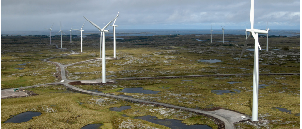
The Smøla wind farm located in Møre og Romsdal County is Norway's largest wind farm

The Smøla wind farm is located in Smøla municipality in Møre og Romsdal County. The wind farm comprises 68 wind turbines with a total installed capacity of 150 MW. The wind farm lies in a flat and open landscape, 10 to 40 metres above sea level. The average annual production is 356 GWh, enough to supply 17 800 Norwegian households.